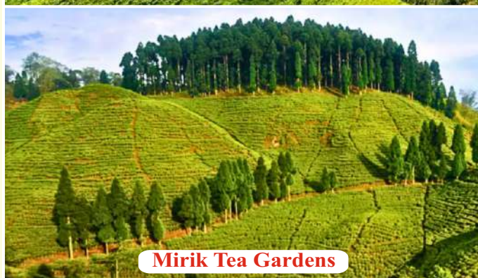
Mirik Tea Gardens