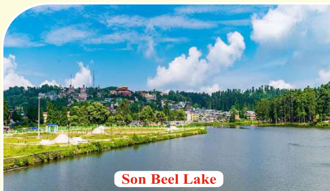
Son Beel Lake