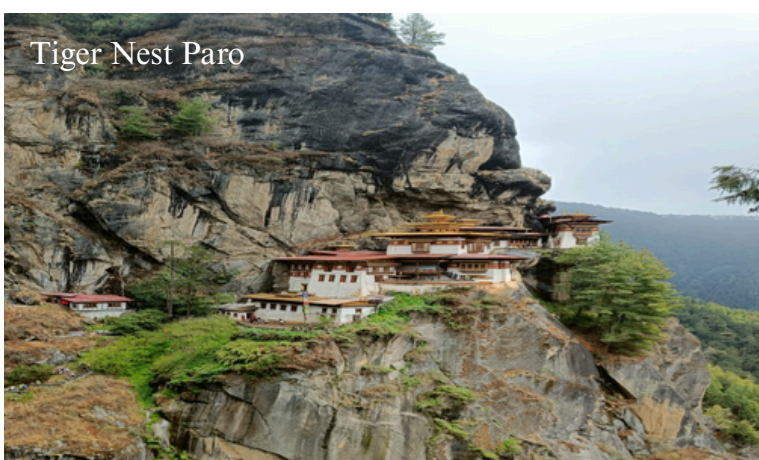
Tiger Nest Paro