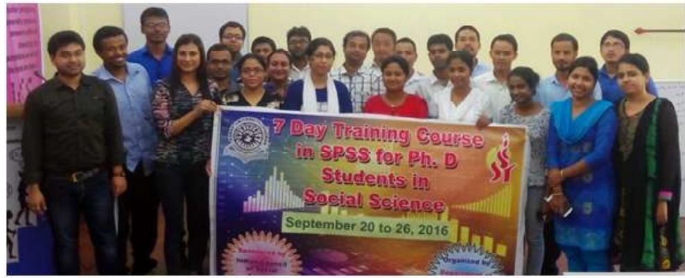
A seven day Training Program Course in SPSS for Ph. D students in Social Science sponsored by ICS$R in the Department in September, 2016.