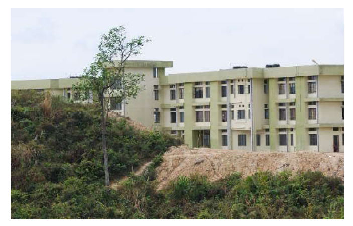
There are at present nine hostels four for boys and five for girls students in the University campus.

The hostels are furnished with basic facilities. Hostel seats are limited and every student may not get the seat in hostel. Availability of seats depend upon the vacancy in the hostel. A seperate Booklet for Hostel Boarders & conduct Rules of the hostel is also available.