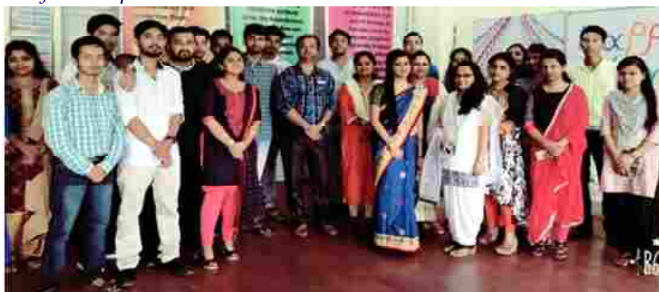
Teachers Day celebration in the Department.