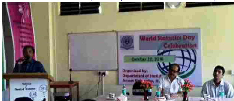
Celebratioan of World Statistics Day in the Department.

SYLLABUS FOR ENTRANCE EXAMINATION: Probability, Probability Distributions, Research Methods and Statistical Methods. Question pattern shall be of both subjective and objective type.