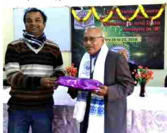
7 Day Training Programme in the Department.

SYLLABUS FOR ENTRANCE EXAMINATION: Probability, Probability Distributions, Research Methods and Statistical Methods. Question pattern shall be of both subjective and objective type.