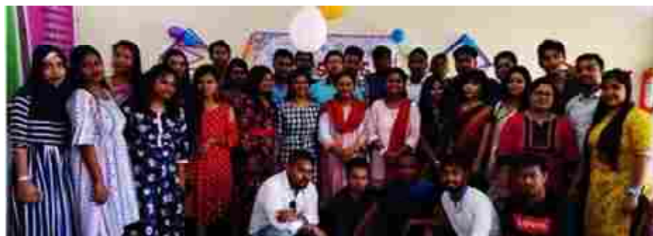
Teachers Day celebration in the Department.