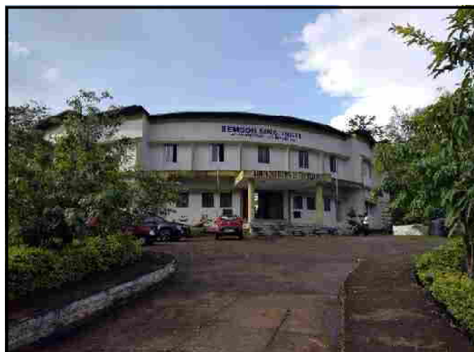
Administrative office at Diphu

Academic and Administrative activities for the Diphu Campus is at present being carried out in a temporary accommodation as the construction of the appropriate infrastructure in the permanent campus site is in progress. Arrangement of Hostel accommodation for students is in the process.