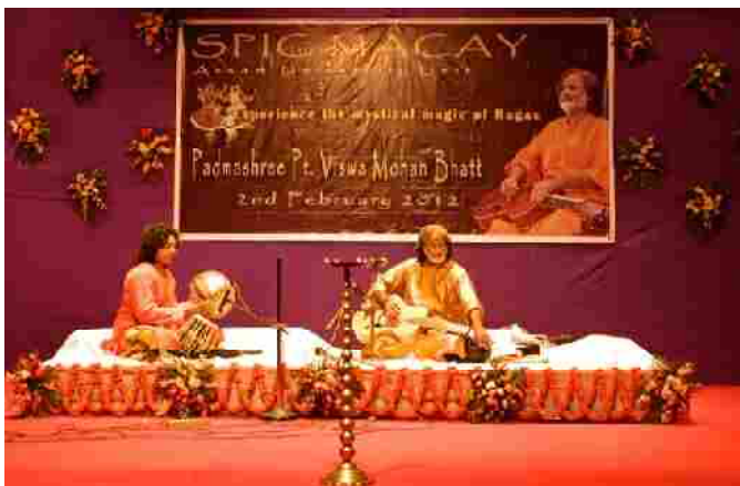
Padmashree Pt. Viswa Mohan Bhatt playing Mohan Bina at Bipin Chandra Pal Milanayatan.

The office of the Dean of Students Welfare looks after the welfare of the students with active support of the representatives of the students, faculty and administration. Student Community Centre has been added from the year 2010 for various students activities.