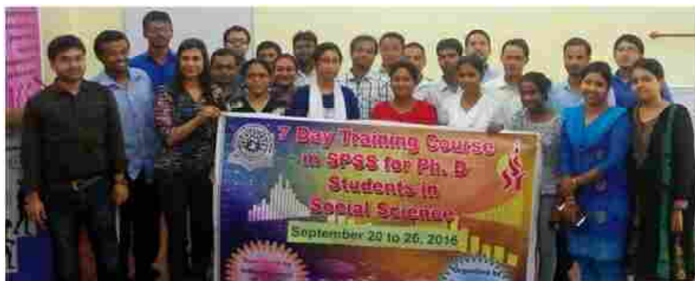
A seven day Training Program Course in SPSS for Ph. D students in Social Science sponsored by ICSSR in the Department in September, 2016.