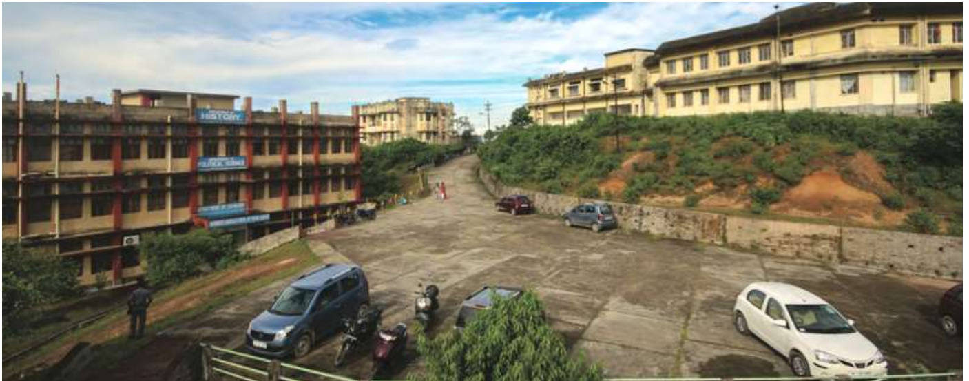
Jadunath Sarkar School of Social Sciences. Established in July 1997.