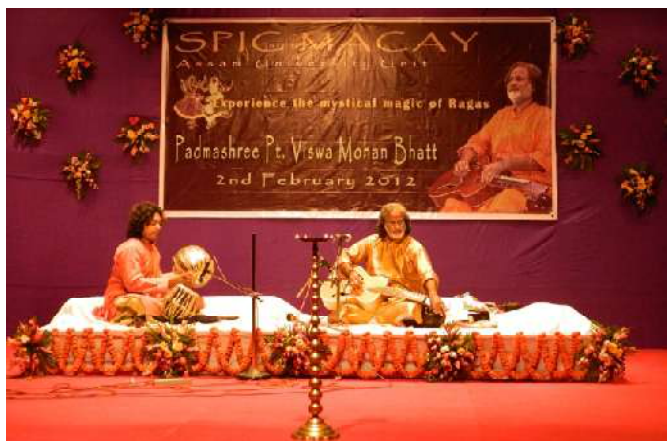
Padmashree Pt. Viswa Mohan Bhatt playing Mohan Bina at Bipin Chandra Pal Milanayatan.

to the students' interests and contributes towards the promotion of students' extra-curricular activities. The Students' Council also organises a week-long social meet every year. During these seven days, the students display their creative talents in the field of sports and other cultural activities.