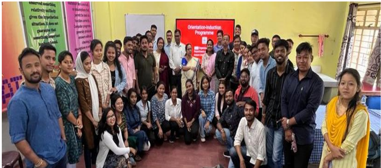
Group Photo of the students, research scholars and dignitaries of the event