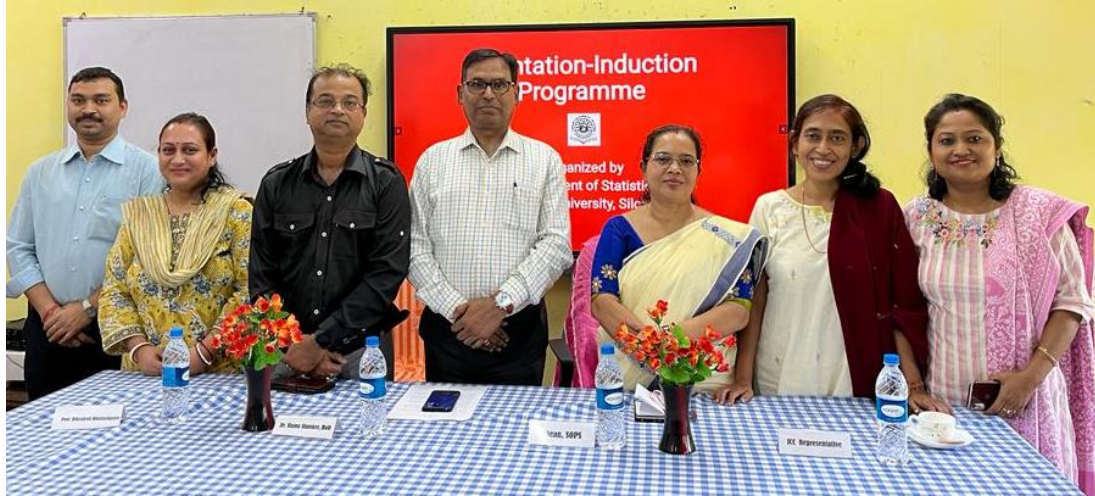
Group photo of dignitaries of the induction program