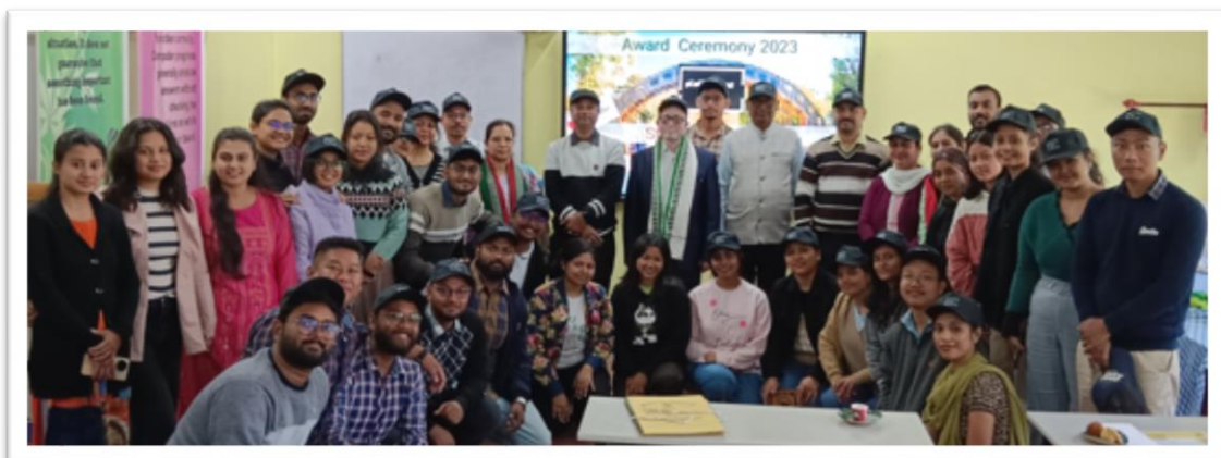
Group Photo of the participants of the Award Giving Ceremony